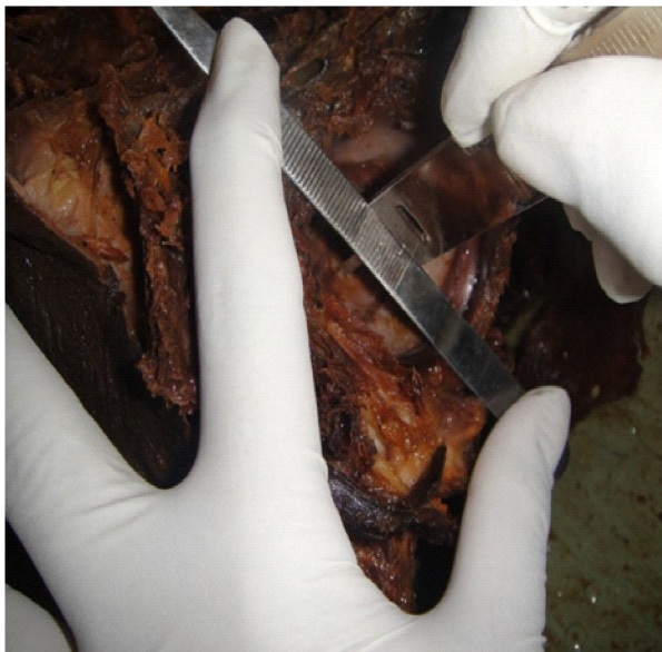
Fig. 1: Showing measurement of depth of acetabulum