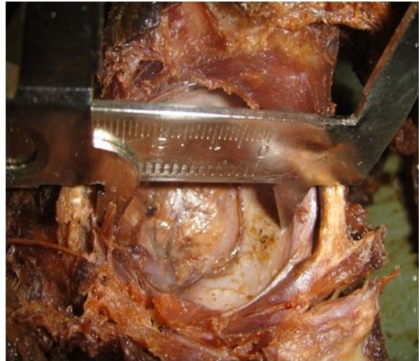
Fig. 3: Showing measurement of vertical diameter of femoral head